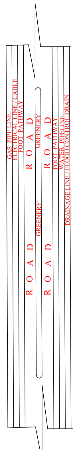
SPECIFICATION OF ROAD